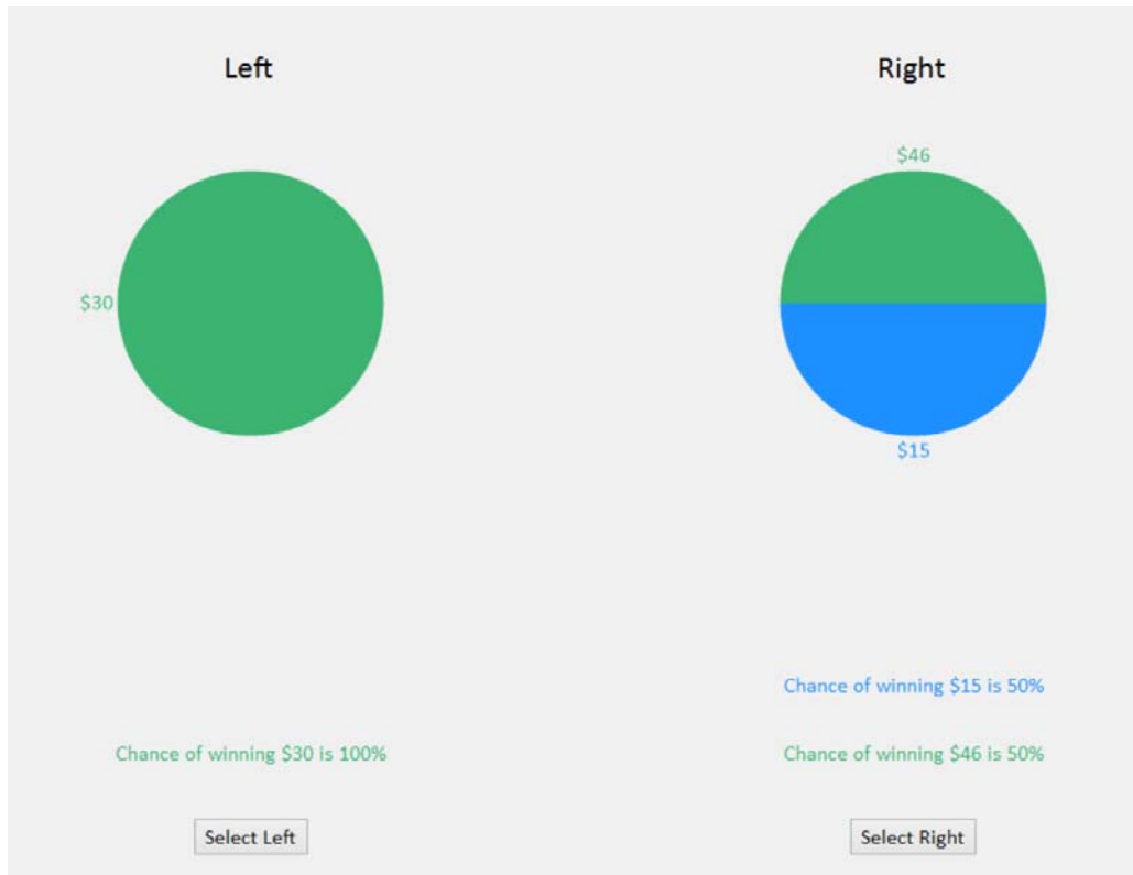
Figure 1: Binary Choice Display